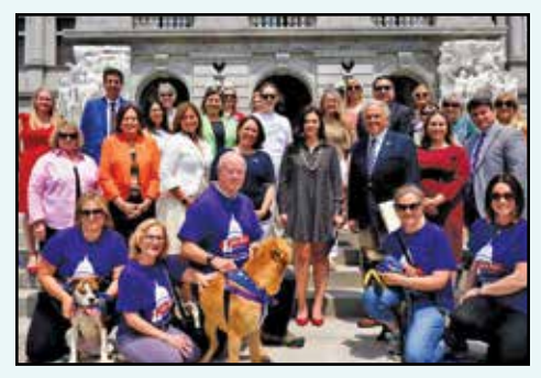
Rescue Dog Day at the State Capitol