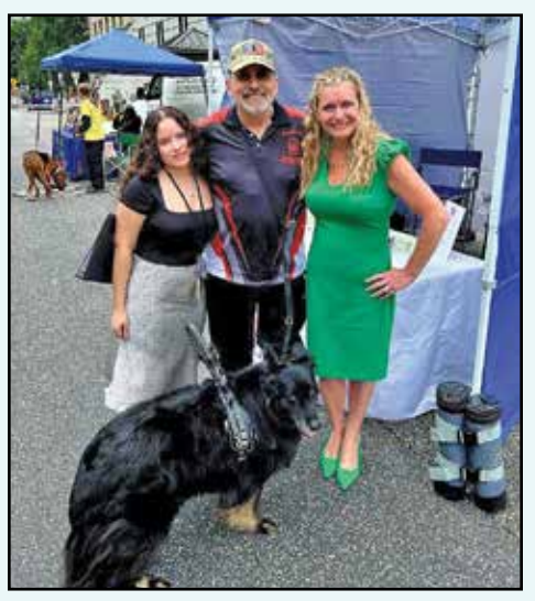
Service Animal Day at the State Capitol