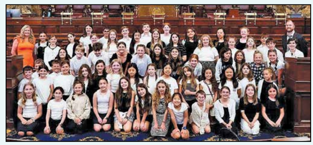
Welcoming Maple Glen Elementary Choir to the State Capitol