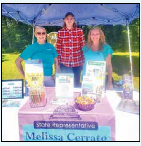
Horsham Day 2024