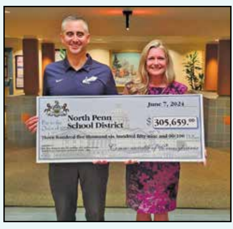
Securing Security Grant Funding for North Penn School District